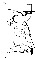
AP251 BC INT